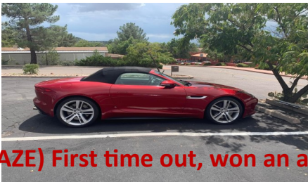
(BLAZE) First time out, won an award at the 2023 Highland Games