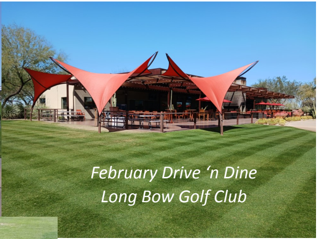
February Drive 'n Dine Long Bow Golf Club