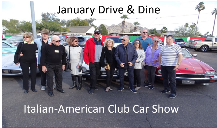
Italian-American Club Car Show